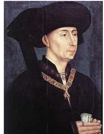
Philip III, Duke of Burgundy, with the collar of the Order