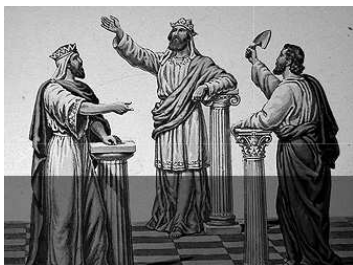
King Solomon, Hiram of Tyre and Hiram Abif