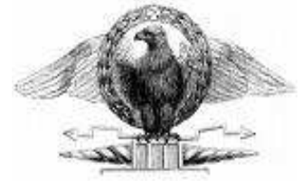
The Roman Eagle depicted here is emblematic of the insignia presented to Roman soldiers so honored.

While these honorable and chivalric orders extend far back in history, the use of the apron as a badge is actually much older than any of these distinguishing means of honoring the deeds, bravery and social status of men. Be proud of our history and of our emblem of purity.